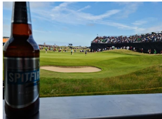
A low-flying Spitfire delights the crowds at the 16 th hole. Shepherd Neame was the Official Beer Supplier to the 149 th Open.

Congratulations to Collin Murikawa the winner of the 149 th Open in Sandwich yesterday. He will take home nearly £1.5 million for triumphing at Royal St. George's Golf Club. Two other winners deserve mentioning. Firstly, the East Kent economy stands to gain an immediate and continuing boost from the impact of the spectators and world-wide media coverage. Secondly, the winning combination of the R&A, Dover District Council and Royal St. George's Golf Club provided an exemplar of how a large-scale sports event should be organised. More spectators attended the four days of the 149 th Open than any match ever played by the England football team. Not only was the organisation better than the recent England v Italy game at Wembley, but so was the weather. We are blessed indeed.